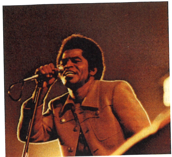
James Brown performs at Tulane Stadium, New Orleans, 24 October 1970.