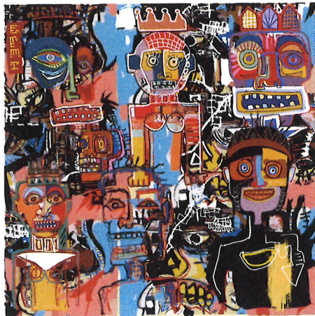
Image inspired by the work of Basquiat.